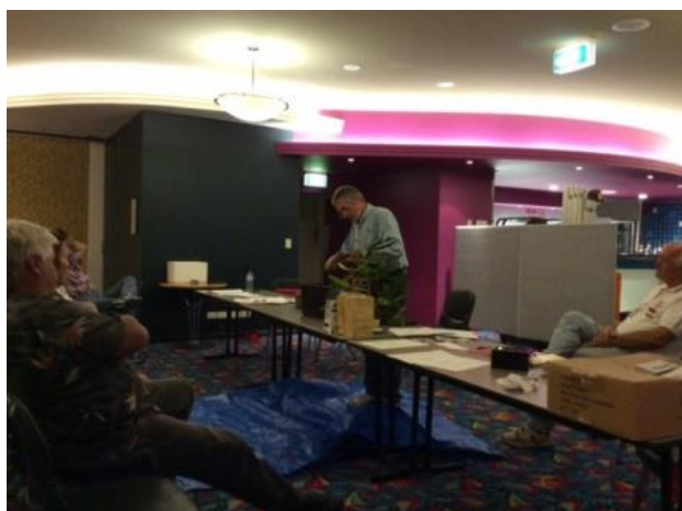
1 Speaker at last Meeting