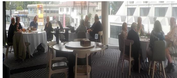
Set up in the bubble.