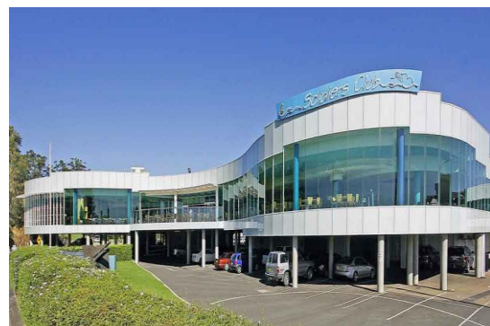
Major sponsor of our club.