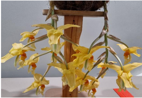
Stanhopea graveolens Una Roberts