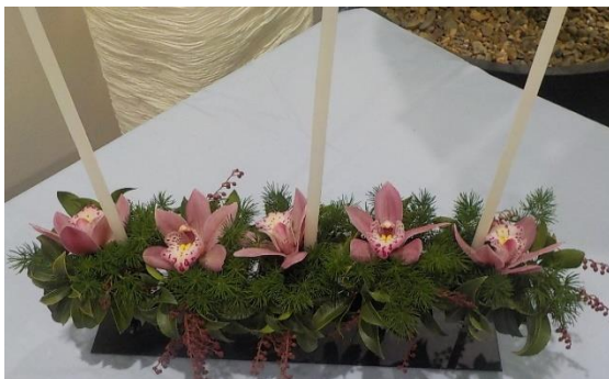
Winter Show Floral Art Champion – Leanda O'Connor