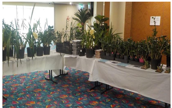
These 2 photos are some of the plants on the club's sales table. Thank you to all those who donated plants.