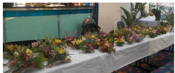
A few of the multiple posies made for sale.