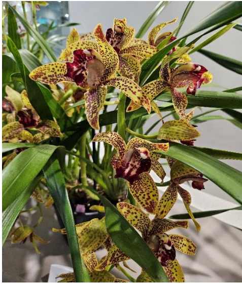
Cymbid Death Wish "Lime Leopard"