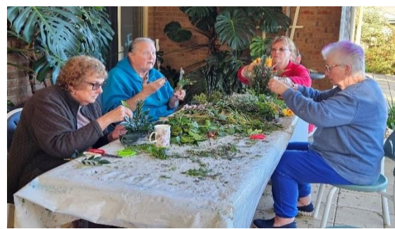
Some of the posy makers hard at work before the show.

There were six sections and a junior section for floral art this show and the displays covered six tables.