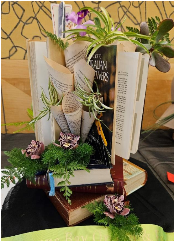
Leanda O'Connor Section 81 Free Style