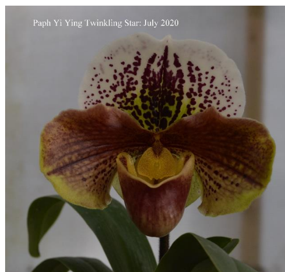
Paph Yi Ying Twinkling Star Ron Boyd