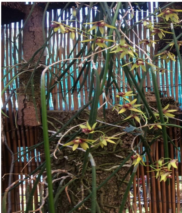
Onc sotoanum "Bunches"