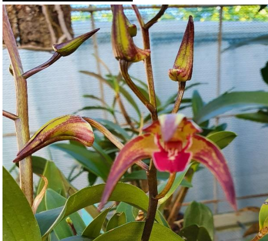
Den Starsheen "Botanic Fireworks" x Rockstar Margaret

This time last year we were gearing up for our Winter Show, however, this year we are just hoping to have a July meeting.