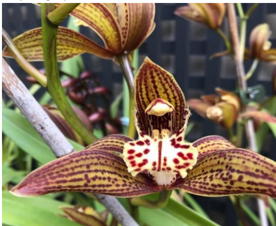
Cym Death Wish Speceled Spectre x DIV Tigers Tail.