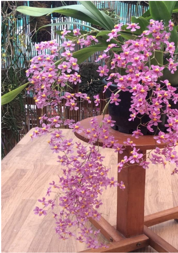
Onc sotoanum "Bunches"