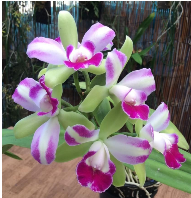
Rlc Village Chief North "Green Genius"