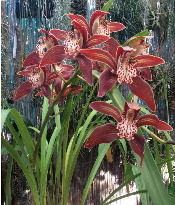
Cym (Rosemary Goode x Pywacket) x Death Wish Royale