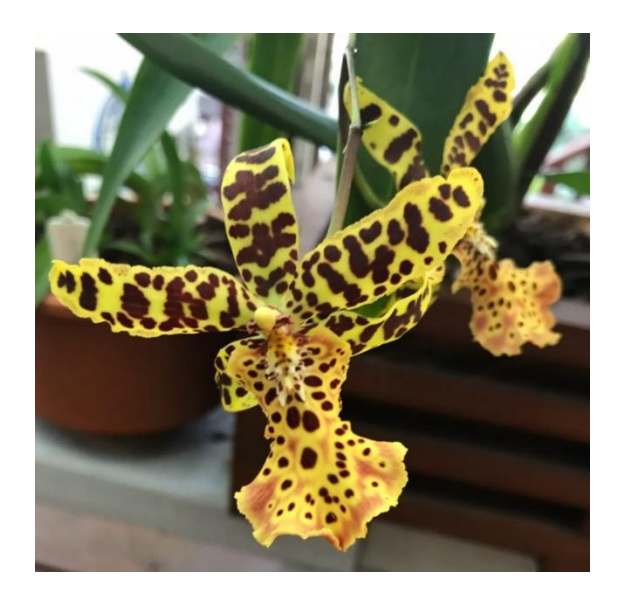
Onc Gold Coin Batter