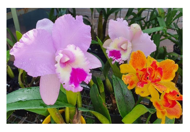
3 of Margaret's Cattleya flowering now.