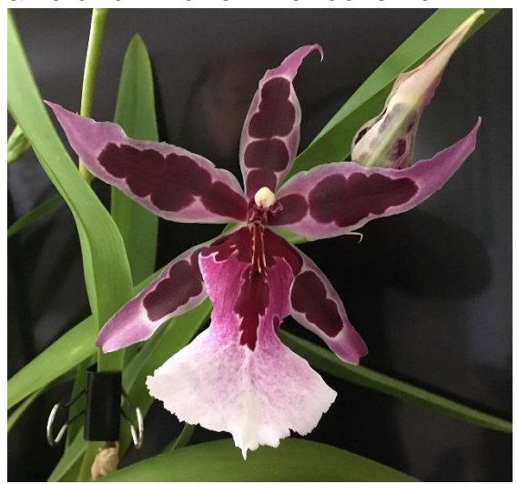
Onc Beallara Tahoma Glacier

From Ken who is very pleased to have an orchid in flower. Well done Ken.