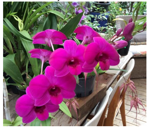
Den. (Fantasy LandxLady Gem) x Dal's Pride 'Algester'