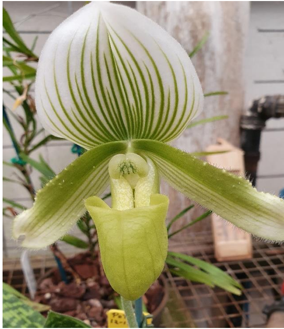
Paph Key Lime x Gaullonianum Allan Boon.