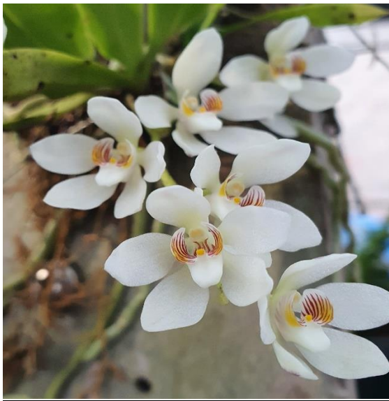
Falcatius Margaret Turner

Feeding time is also here as the plants come out of their resting time. Most growers now use a 9-month pelletized fertilizer and suggestions differ as to whether or not to use a liquid fertilizer as well. If so, remember it is better to use weekly weakly that to use a full dose. Giving pots a good flush every 2 to 3 waters is also good practice. Watering requirements vary at this time of year depending on the weather, so check what the pots feel like before watering to ensure that you don't over water.