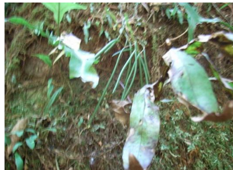
Figure 2 Dendrobium striolatum shady position