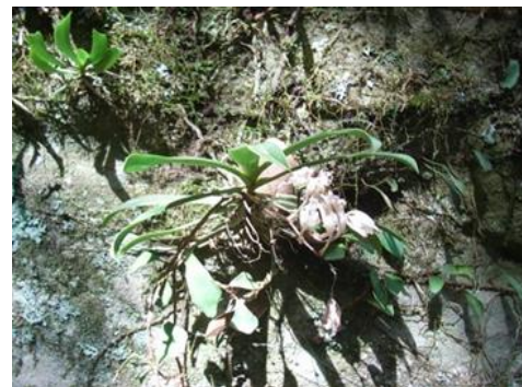
Figure 4 Sarcochilus falcatus