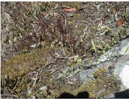
Figure 1 Dendrobium striolatum exposed position