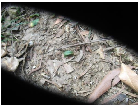
Figure 3 Chiloglottis species not in flower