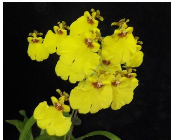
Onc. "Sweet Sugar" Million dollar

Tie between these two plants both owned and benched by Una Roberts. Well done Una.