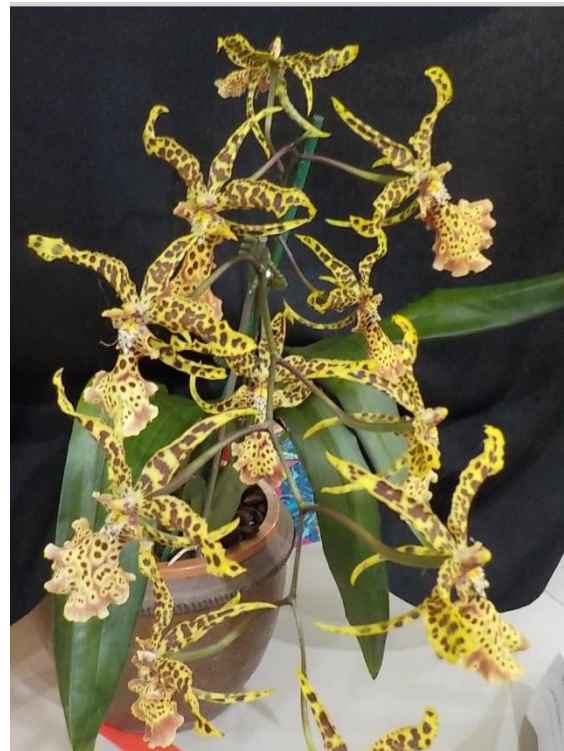
Mitts Cotron (Brglades) Onc Gold Coin Battler.