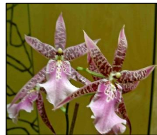
With Miltassia Aztec X Milt. castanea

Can the winner of 2012 perpetual trophies of the Winter Show, return them to the Secretary ASAP; they can then be ready for the 2013 Show Season.