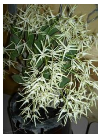
Rob & Sue Fish with Dendrobium aemulum