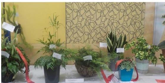
Some of the large display of ferns and foliage that were benched.