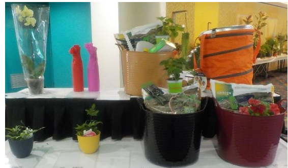
Multi prizes at Show. We appreciate support from Bunnings for some of these prizes.