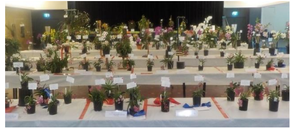
Some of the 272 plants benched at the Native Show