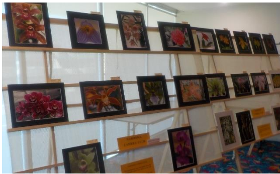
Narooma Camera Club displayed some of the photos that were taken at our Spring Show as well as the South & West Regional Show at Moruya.