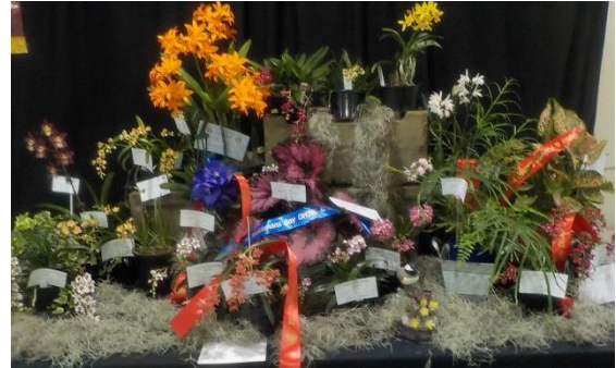
Display at native Show