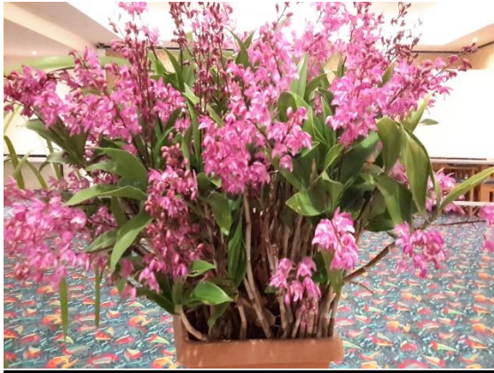
Den. Unknown Allan Bird