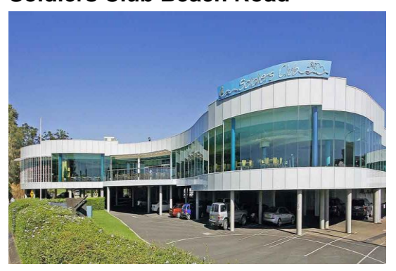
Major sponsor of our club.