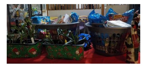
Multi draw raffle prizes.