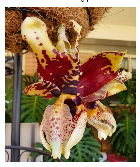
Needed to put an orchid in with the photos, so this is my Stanhopea in flower now.