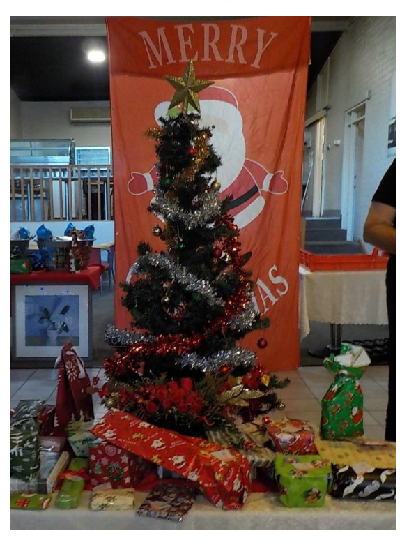
Christmas tree with secret Santa gifts