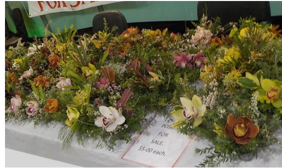
Posies at Spring Show

Raffle Plants: Purchasing plants for our monthly raffle is becoming more expensive and looking back at the money collected for raffle ticket sales, indicate that we are only just breaking even. Therefore, we are looking for members to assist by donating established plants of any sort in at least an 80mm pot for the raffle table each month. Plants can also be on a mount as long as it is established.