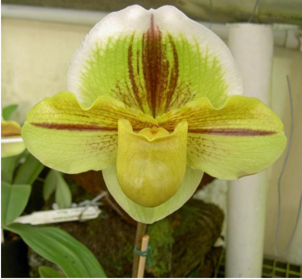
Grand-Champion Paphiopedilum Wessex Way "Zoe Pax"