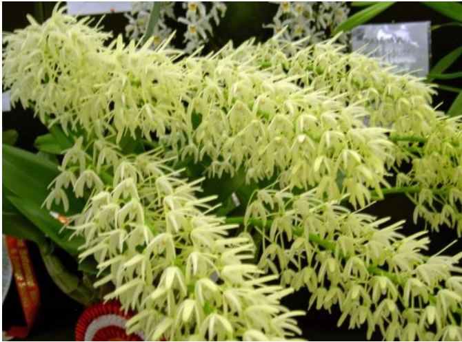
Champion Orchid, any other Genera