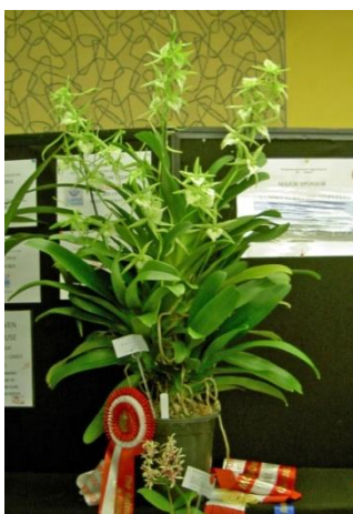
Grand Champion of the show