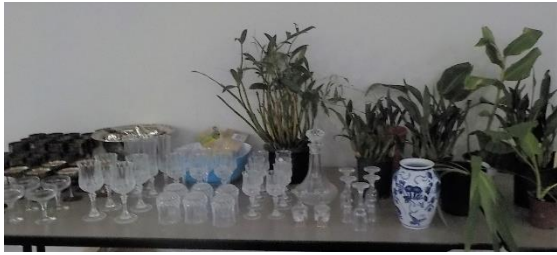
Remainder of the auction table