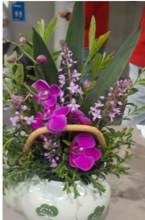
Floral Art Display Pam Mason