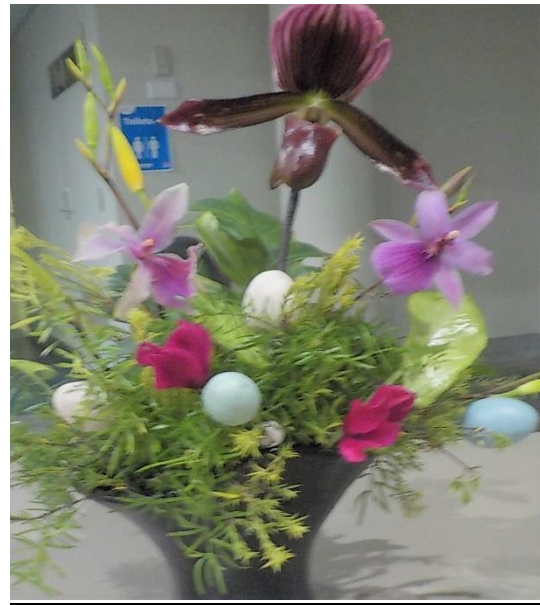
Anne-Marie's Floral Art display

Plenty of spikes evident, except on my cymbids. They are probably not getting the feeding they should be. As this is the growing season before resting a bit over winter for some plants, keeping fertilizer and water up to them is important.