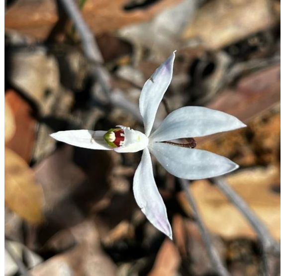
Caladenia picta painted finger. This was found in the same property as the previous photos of the hooded orchids that we saw late last year.

The cultural information offered in this newsletter is intended as a guide only. Bateman's Bay Orchid & Foliage Soc. Inc. cannot be held responsible for any loss or damage that may occur to plants as a result of using this information.