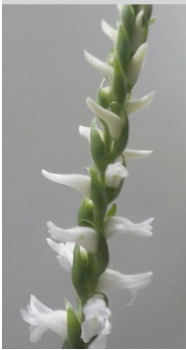
Spiranthes oderata Leanda O'Connor