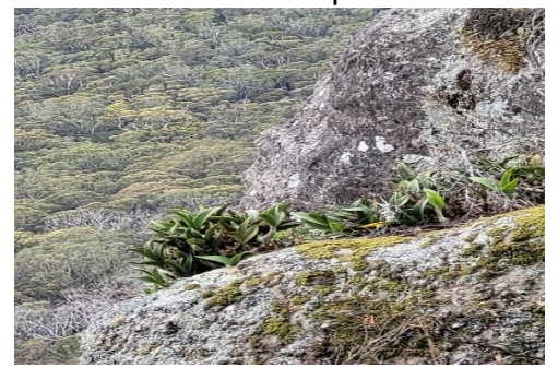
Den speciosum on Pigeon House Mountain