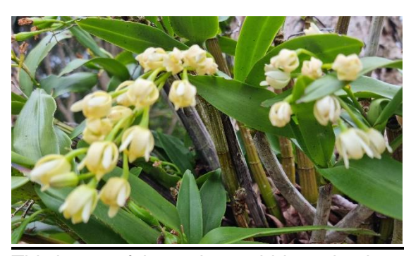
This is one of the native orchids endemic to Norfolk Is.

able to let you all know. A $10 deposit for your place at the table will be expected once we know the cost. As usual, there will be a Secret Santa up to the value of $10 for those who wish to participate. Due to rain, the Nelligen BBQ and orchid hunt was cancelled, however it was decided that we would just do the orchid hunt on Sunday 30<sup>th</sup> October at 12md meeting at the Nelligen cemetery.