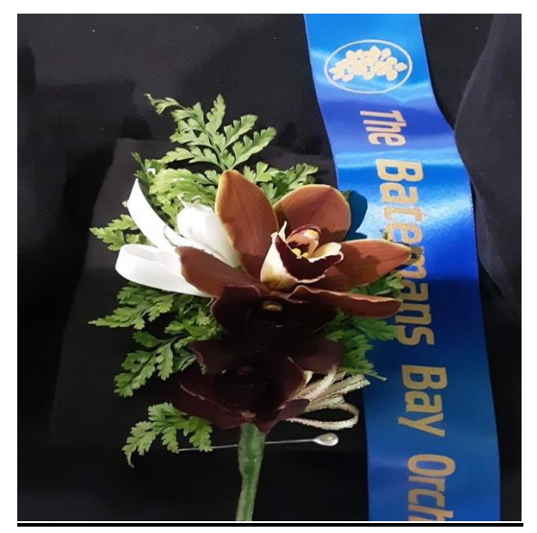
Champion Floral Art Leanda O'Connor

Winter 14 15 & 16 July Spring 1 2 3 September Native 20 21 22 October