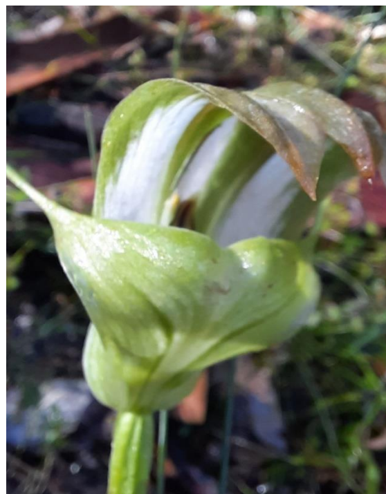
Pterostylis Baptistii King Greenhood found at the same property