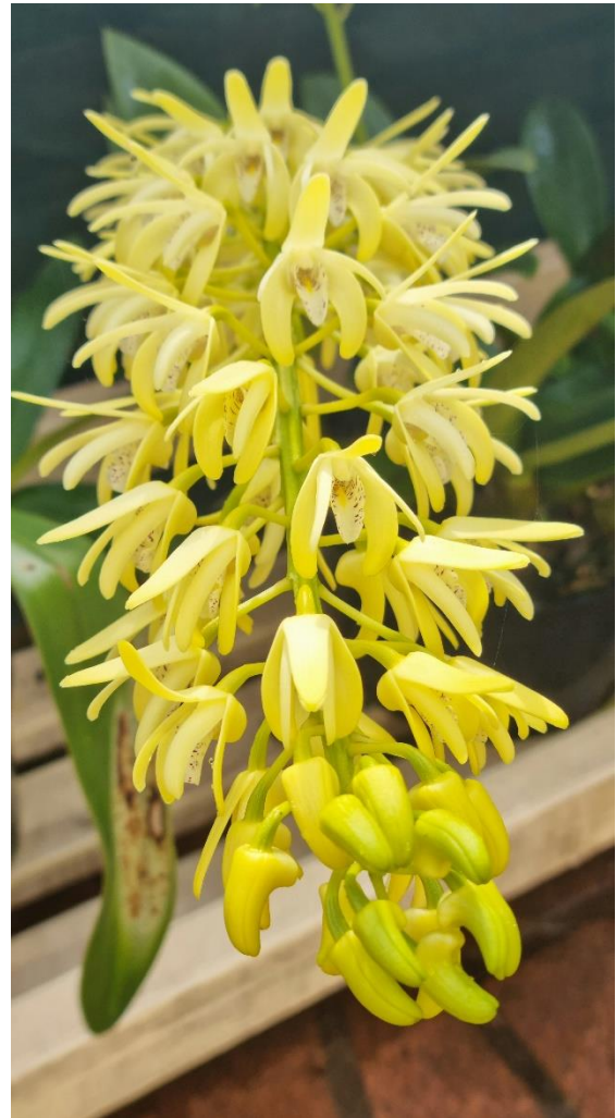
One of my Speciosum

The following are some photos from the 2019 Native show. Enjoy