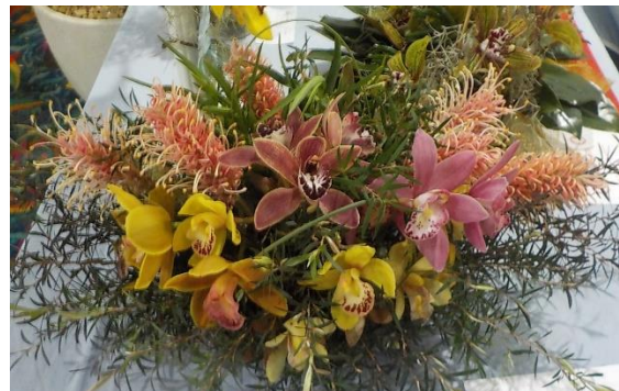
Champion Floral Art Shirley Lamont