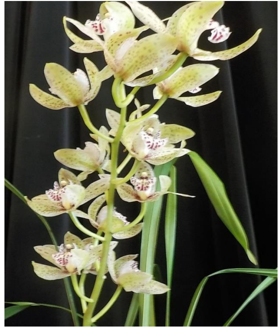
Liz Cleaver Cymbid Death Wish Finger Lime Fizz