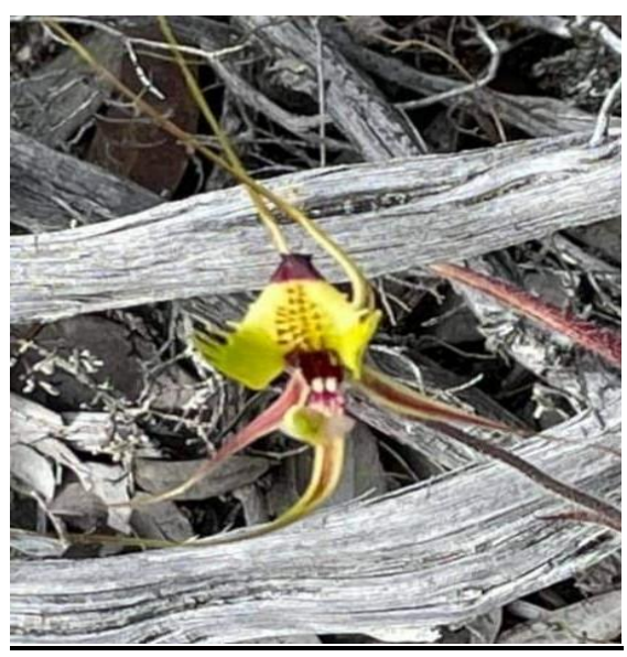
I have a cousin who is currently enjoying a wildflower tour in Western Australia (lucky woman) & she sent me this without a name.